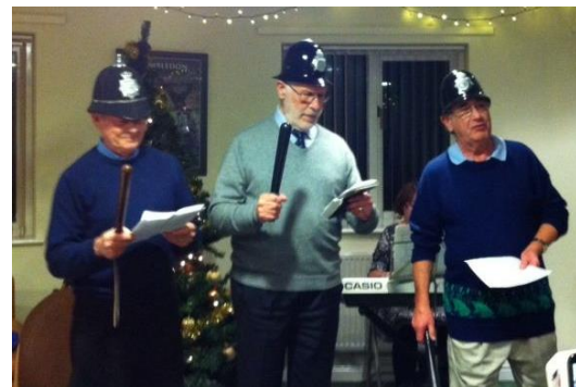
The 3 tenors (!?! ) at the Christmas Party