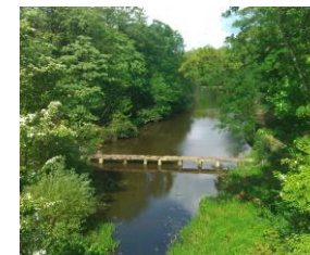
NOSTELL PRIORY and PARKLAND