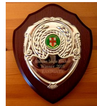
The 2016 City Afternoon Knockout Shield is to be displayed in the Trophy Cabinet